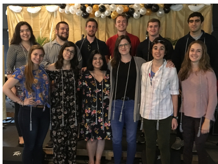
Our wonderful Class of 2019!