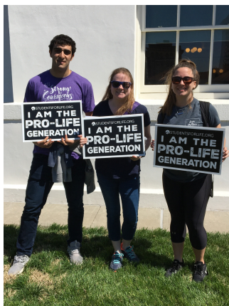
Catholic Monarchs at the first Virginia March for Life in Richmond, VA.