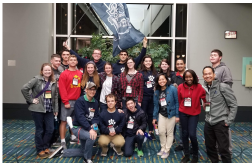
Catholic Monarchs at the 2019 Virginia CCM Summit held in Richmond, VA.