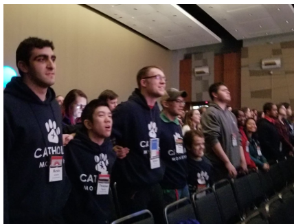
Catholic Monarchs sing during the final session of Summit 2019.