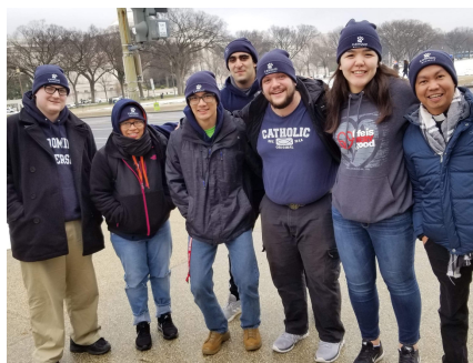
Catholic Monarchs at the Annual March for Life in Washington, D.C.