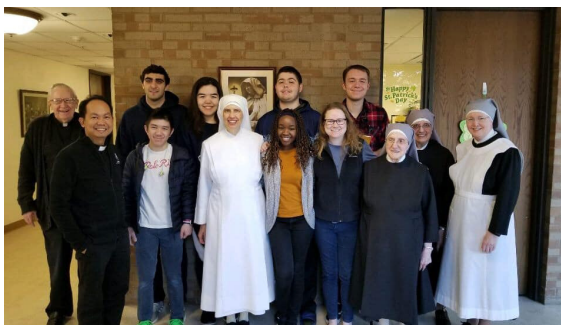
Catholic Monarchs along with the Little Sisters of the Poor in Newark, Delaware.